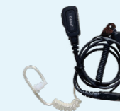
Audio tube Earpiece